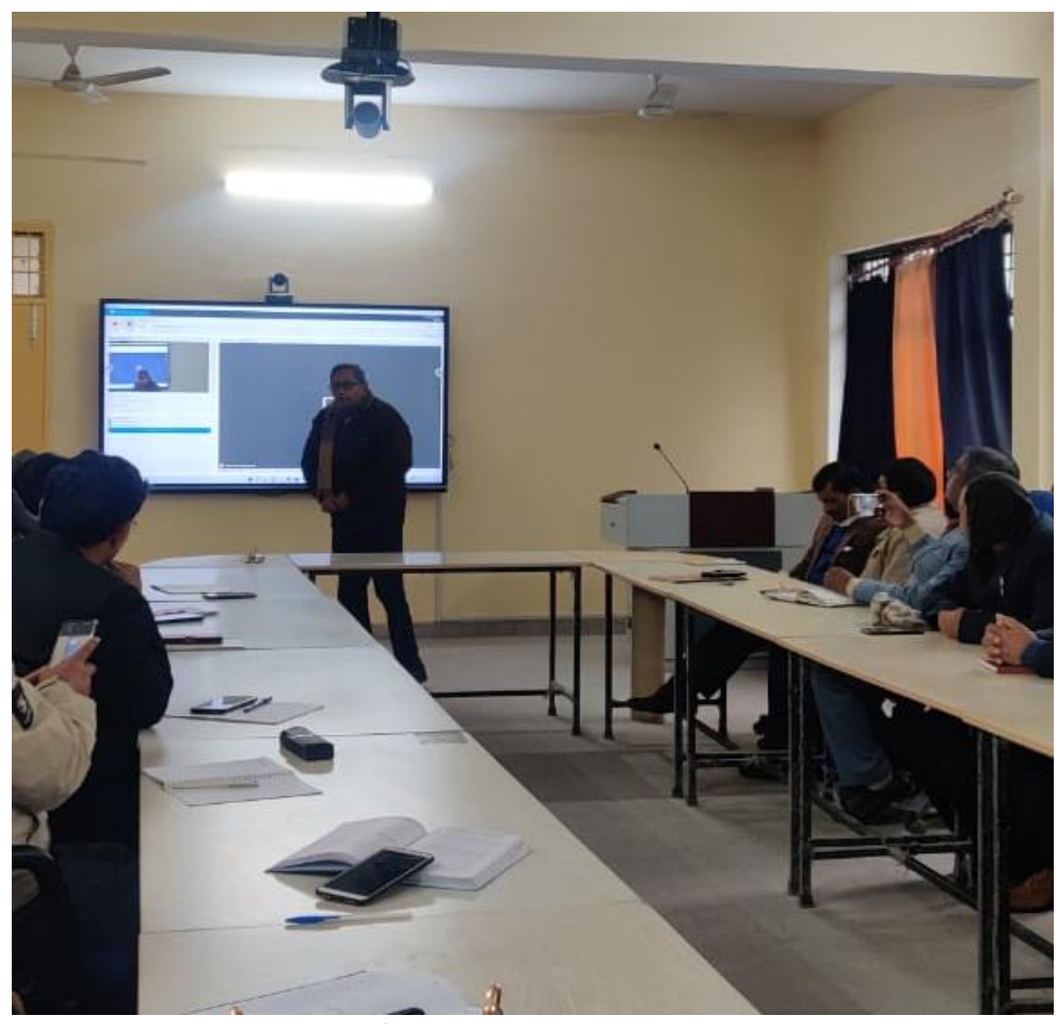
Faculty Orientation Program-2020