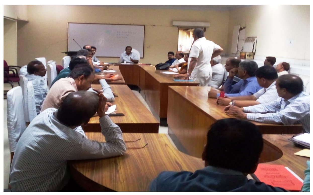
Faculty Orientation Program-2018