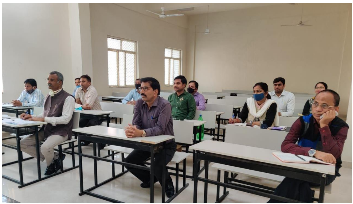
Faculty orientation Program-at Azamgarh Campus