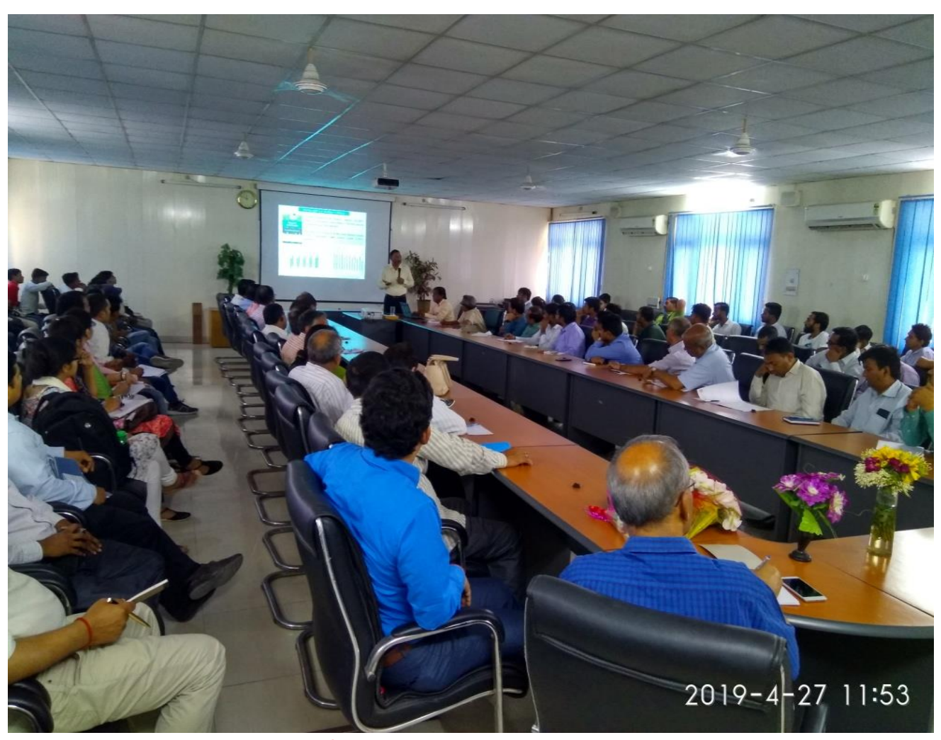
Faculty Orientation Program-2019